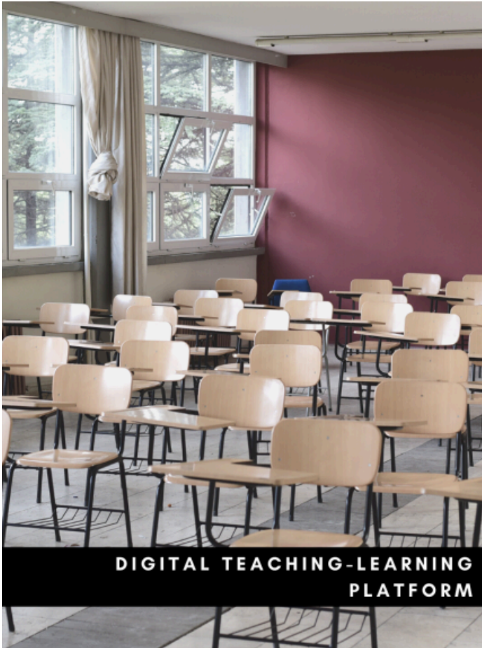
DIGITAL TEACHING-LEARNING PLATFORM