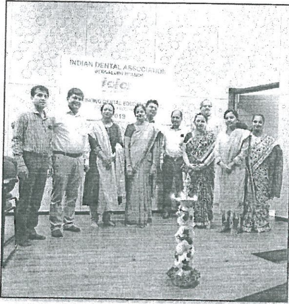
Lighting of the Lamp